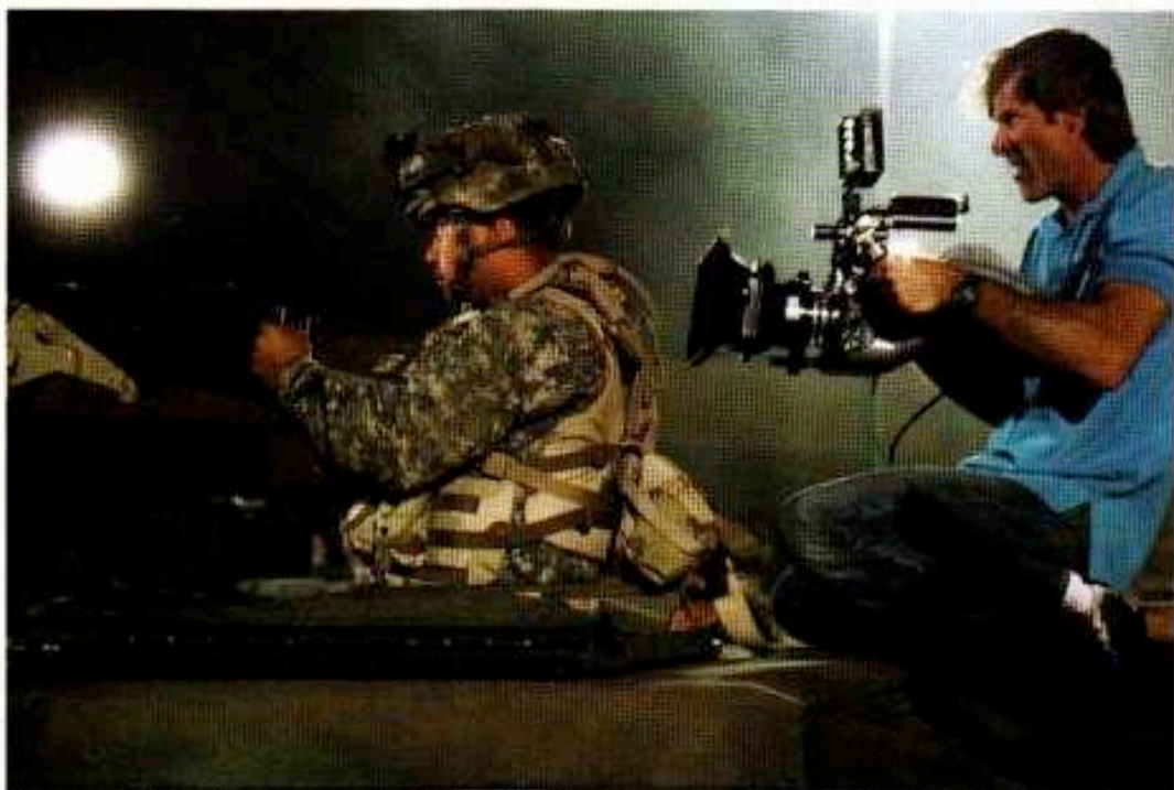
After filming the 2007 installment of "Transformers" in New Mexico (above), Michael Bay and crew returned to shoot the upcoming Transformers: Revenge of the Fallen.