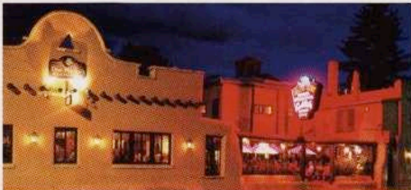
Guest accommodations at the Historic Taos Inn are sprinkled throughout a cluster of 19th-century adobe houses.

"New Mexico is entering a new phase of maturity as a production and postproduction destination," Alper says.