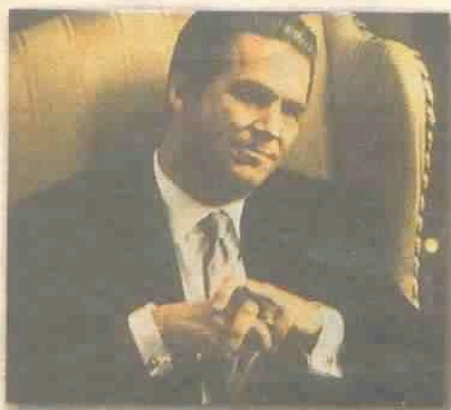
JEFF BRIDGES PLAYS THE NATION'S CHIEF EXECUTIVE.