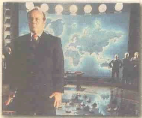
JACK NICHOLSON GIVES THE PRESIDENCY A TRY.

Maybe that's why it's hard to get excited about a candidate who just wants to lower taxes. But don't take our word for it. Instead, take Preview's election-year challenge. See