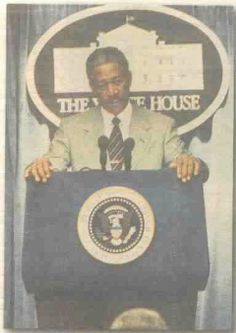
MORGAN FREEMAN FINDS HIMSELF WITH MORE PROBLEMS THAN HE BARGAINED FOR AS COMMANDER IN CHIEF.

10. As President Bobby, this veteran character actor inadvertently turns to an illiterate simpleton, who learned everything he knows in life by watching television, for advice in the 1979 comedy Being There .